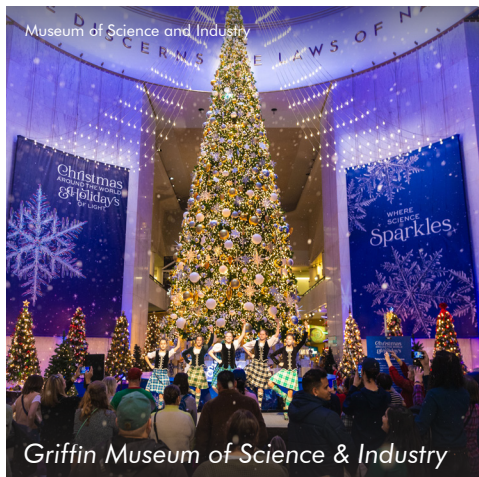
Griffin Museum of Science & Industry